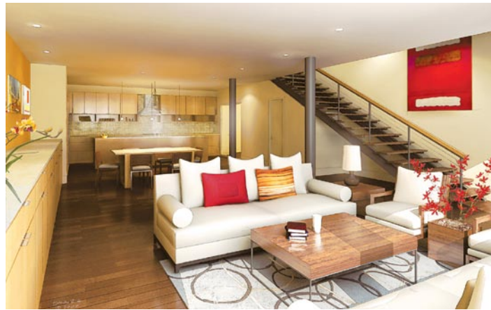
Named after the original building from 1909, Leona combines historic details and new construction to create a modern aesthetic with accents of stone, steel, oak, all distinguished by the craftsmanship found in Seattle's early homes.

was important to me to take special care to blend all of the improvements with the surrounding neighborhood which not only enhances the building but enhances the community."